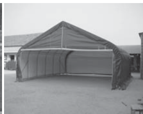
Two Car Garages