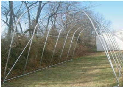
Bolt Together Frame Easily Assembled