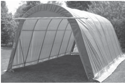
Drive Thru Capability Makes It Easy To Store Equipment/Vehicle