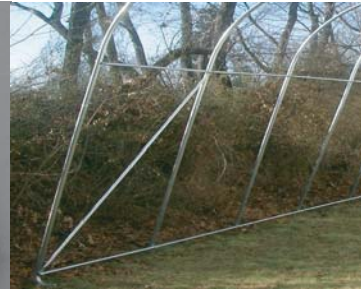
Wind Brace At Each Corner