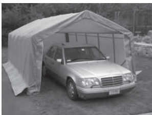
One Car Garages