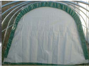
Two Zippered Doors Included with Unit