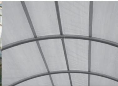
60" Rafter Spacing provides Extra Strong Frame