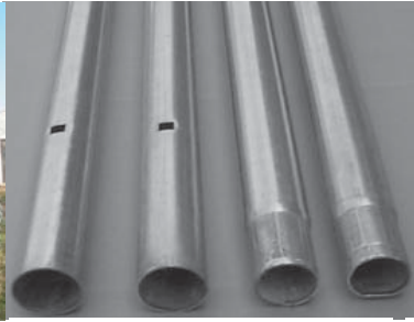
All Galvanized Frame for Corrosion Resistance