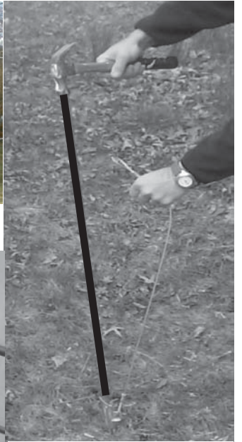
High Quality Anchors at Each Upright & Corner