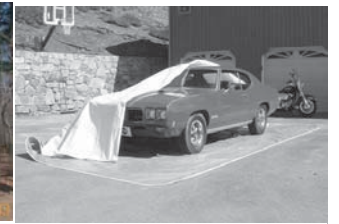
Car & Cycle Pockets