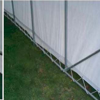
Adjustable Cover Tension