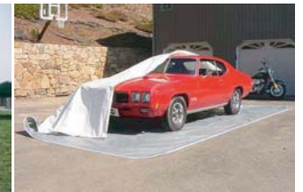
Car & Cycle Pockets