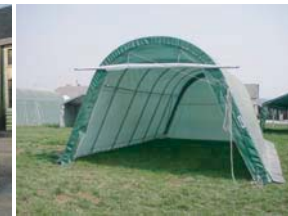
Portable Storage Buildings