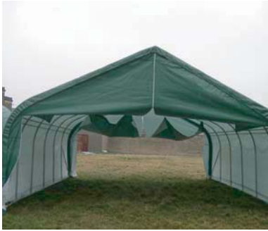
Two Doors for Easy Drive Through Capability