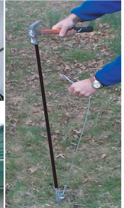
High Quality Anchors at Each Upright & Corner