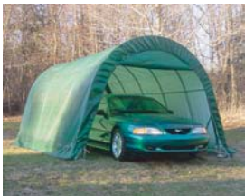
One Car Garages