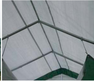
48" Rafter Spacing provides Extra Strong Frame