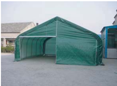
Triple Zipper Doors Allow Independent Operation