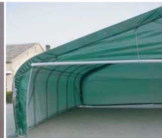
Optional Roll Up Door Kit