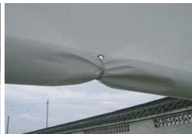
Bungee Cord Door Hold Ups Included