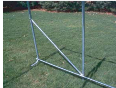
Structural Wind Brace on Each Side