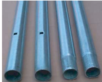
All Frame Members Long Life Galvanized Steel