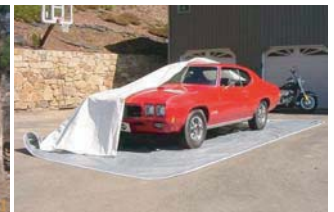
Auto & Cycle Pockets