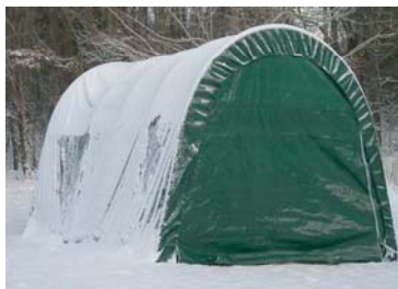
Withstands Winter Weather