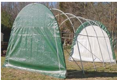
Zippered Door on Both Ends of Unit