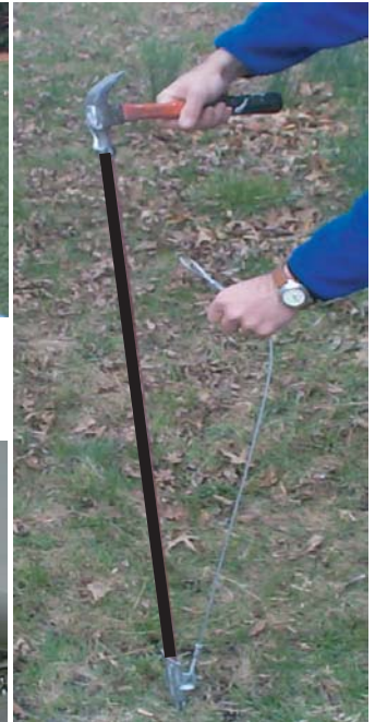
Anchors & Drive Rod Included with Unit