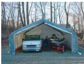
Two Car Garages