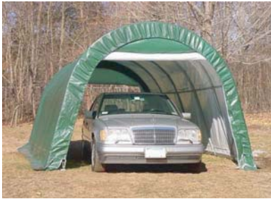
Doors on Both Ends allows Drive Through Capability